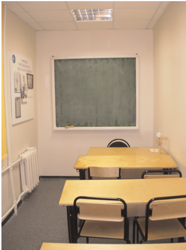
Figure 4: Vepsian class in room 302 at Petrozavodsk State University

but they appeared to voluntarily discriminate between their readers since the messages were written in what appeared to be a “secret code” that only a few could decipher. Indeed, they did not translate what they were discussing into Russian, which usually happened in the presence of a non-speaker of Vepsian. In doing this, the students demonstrated the ability to turn secrecy from a social weakness into a strength through the use of the Vepsian written form. They displayed a skill that others did not possess and were proud of it, and they did not feel the need to hide it. Power relations of inequality were reversed in this case since those who generally dominated the public space linguistically were now marginalised and those who were forced to hide or to be ashamed of their knowledge of the Vepsian language could now freely demonstrate the ability to be proficient in it (Woolard and Schieffelin 1994, 56). As Jones (2014, 54) states, “secrets produce value through both the exclusion of outsiders and the inclusion of insiders.” Through antipodal concealment practices, the students, and Vepsian youth in general, gained confidence (Luhmann 1989), produced trust within their