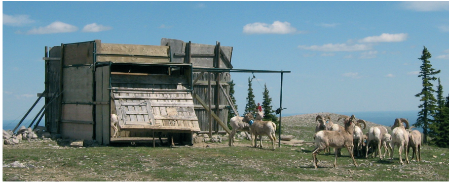
Fig 1. Corral trap baited with salt used to capture bighorn sheep at Ram Mountain, Alberta, Canada.

with salt (Figure 1; see methods and Réale et al. 2000 for details). Pedigree-based quantitative genetic analyses determined that both traits had an additive genetic basis and were negatively genetically correlated (Réale et al. 2009). The availability of detailed life history information for most individuals also provided links between personality and fitness components. For example, bold and docile ewes were found to reach sexual maturity before shy and aggressive ones (Réale et al. 2000). Boldness in ewes was also positively correlated with weaning success (Réale et al. 2000) and survival in years of high cougar ( Puma concolor ) predation (Réale and Festa-Bianchet 2003). In males, docility and boldness were found to have a positive effect on longevity, a weak negative effect on early life reproductive success, and a strong positive effect on late life reproductive success (Réale et al. 2009). Personality therefore appears to play important roles in the ecology and evolution of this species.