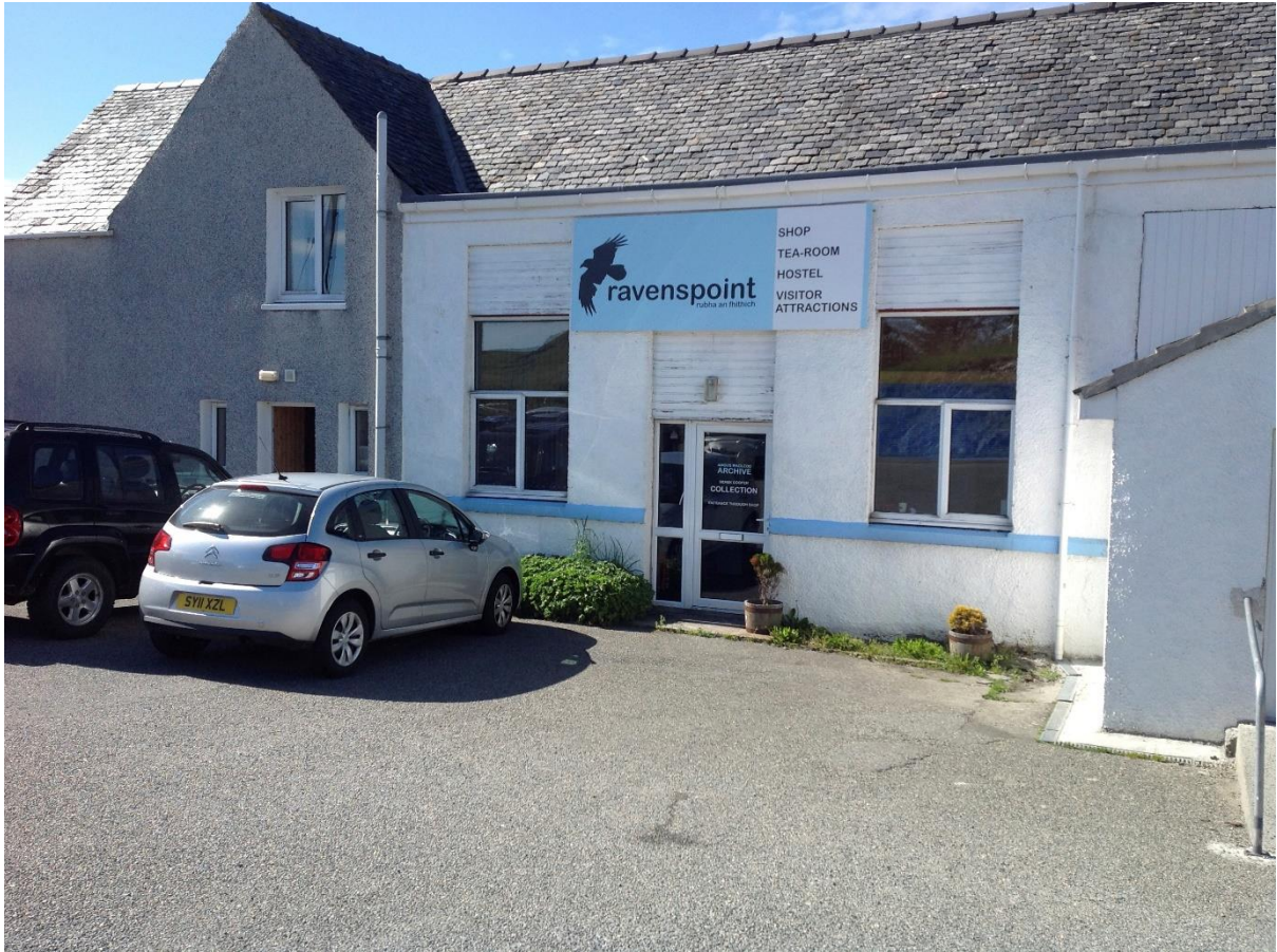
Figure 2 – Ravenspoint Centre and home of Comainn Eachdraidh Pairc.