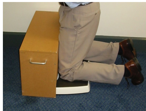
Fig. 3 Subject kneels with one knee on each scale