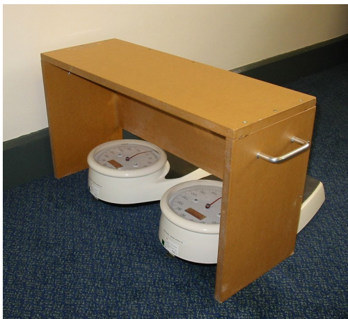
Fig. 1 Two scales are placed on the floor with dials concealed from the subject

We present The Aberdeen Weight-Bearing Test (Knee) (AWT-K), an objective test specific for anterior knee discomfort assessed via direct load bearing. We assessed its validity by performing it on subjects with no knee symptoms and subjects who had undergone anterograde tibial nailing. It may be a useful objective outcome measure to quantify anterior knee discomfort following anterograde tibial nailing.