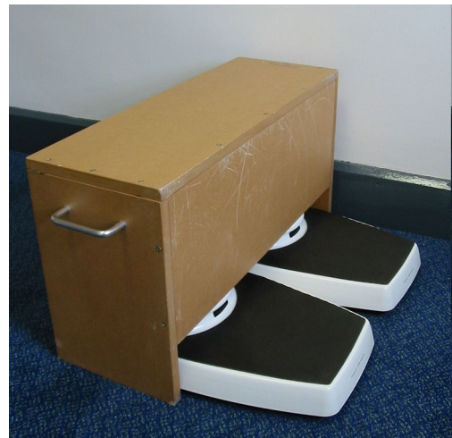
Fig. 2 Two scales are placed on the floor with dials concealed from the subject

The weight passing through each knee is then recorded at 0, 15, 30, 45, and 60 s. The test ends at 60 s, or if the subject is unable to continue the test for the full 60 s.