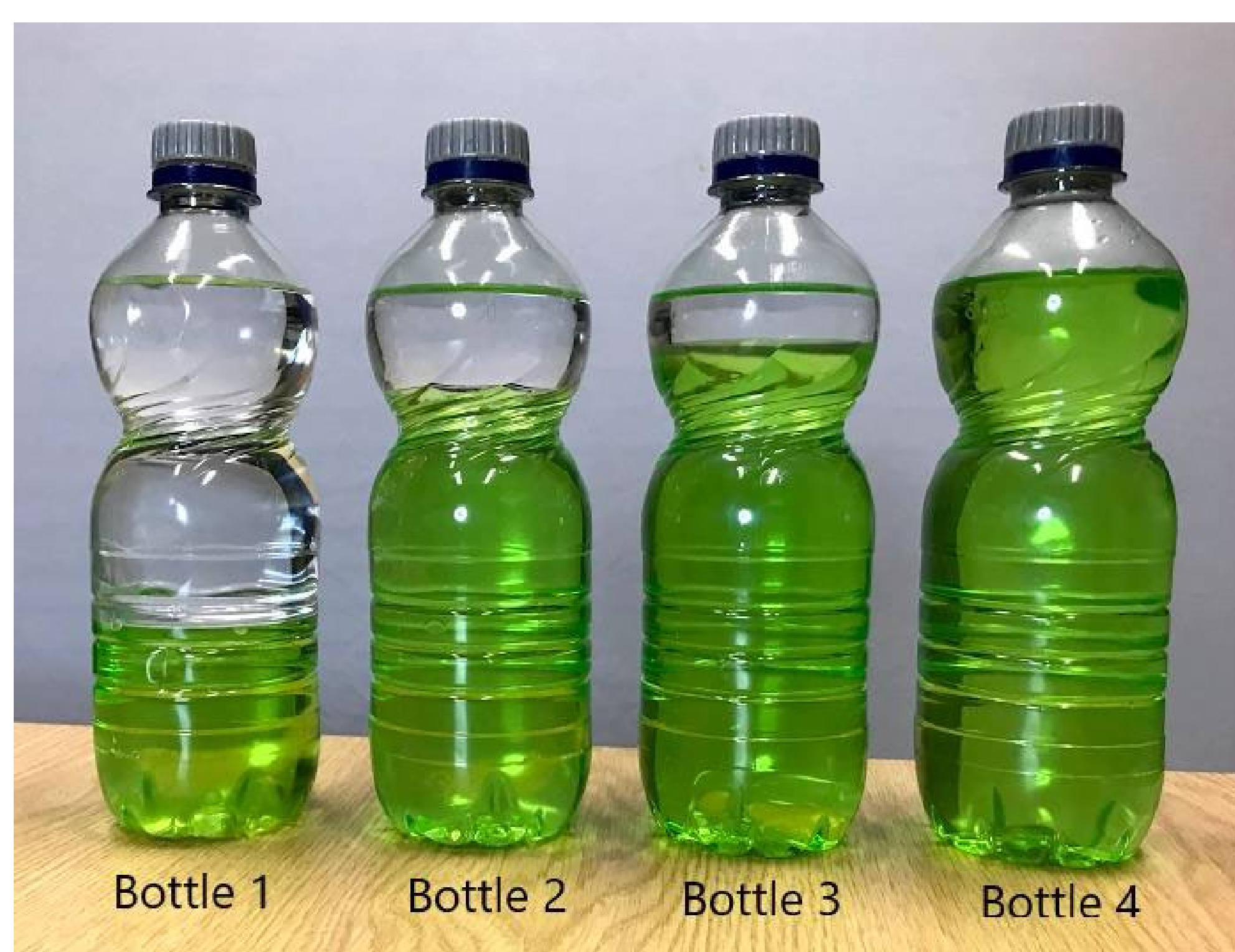
Students had to match the 'blood plasma' bottles with the matching 'urine sample' tubes. The green food dye represented a drug that had to be cleared by the kidneys.