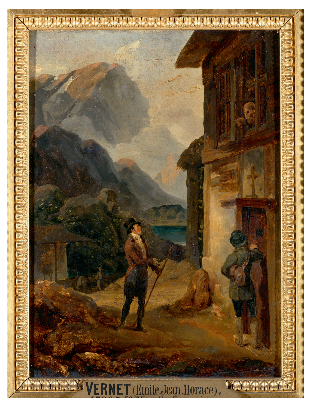
Image 2: Vernet's interpretation of the Saint-Gothard episode from 1818, photo © RMN-Grand Palais (domaine de Chantilly)/Gérard Blot.