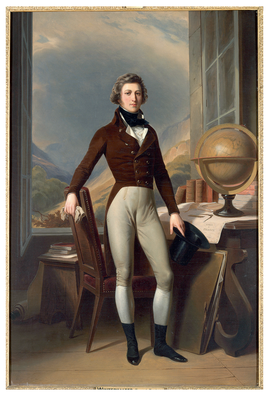
Image 4: A Winterhalter copy of Auguste Couder's portrait of the Duc de Chartres can still be seen in Reichenau today, photo © RMN-Grand Palais (domaine de Chantilly)/Gérard Blot.