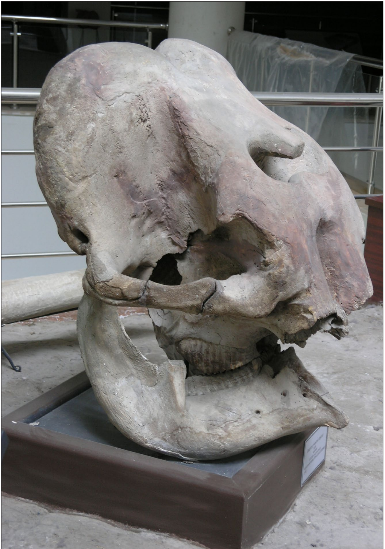
Figure 2: A partially reconstructed skull of Elephas maximus from Gavur Lake Swamp (MTA Natural History Museum, Ankara).