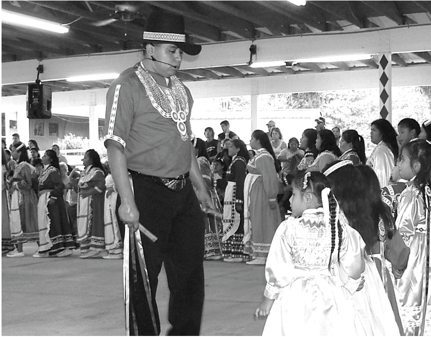
Figure 2 Many Choctaw social dance ensembles are dominated by children.

twenty-five minutes each day every July during the massive Choctaw Fair. Figure 1 shows one social dance ensemble performing on the tribal dance grounds during the 2008 Fair. The dance groups represent neighbourhoods and/or schools; many ensembles are mostly kids (see Figure 2).