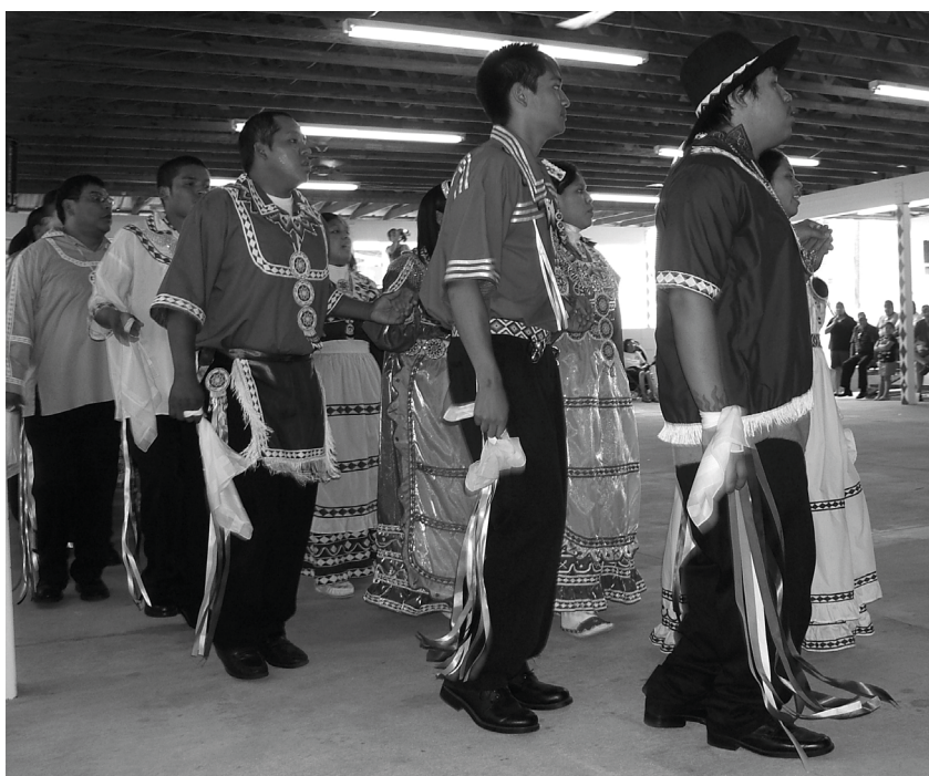
Figure 1 A Choctaw social dance ensemble performing on the tribal dance grounds.

At about the same time that the Choctaw social dances were being revived, white-derived dances done to fiddle in people's houses (more-or-less square dances) were falling out of use. Some Choctaw whom I have interviewed feel that this happened simply because alternative non-Choctaw dances and dance venues burgeoned. Others told me that the tribal government frowned on the bad behaviour occasionally surfacing at the all-night dances. In any case, what was now formally called the 'house dance' did not disappear. Instead, it acquired a small, enduring niche within the officially-sponsored revival of Choctaw social dance: the house dance took its place alongside the duck dance, walk dance, and raccoon dance.