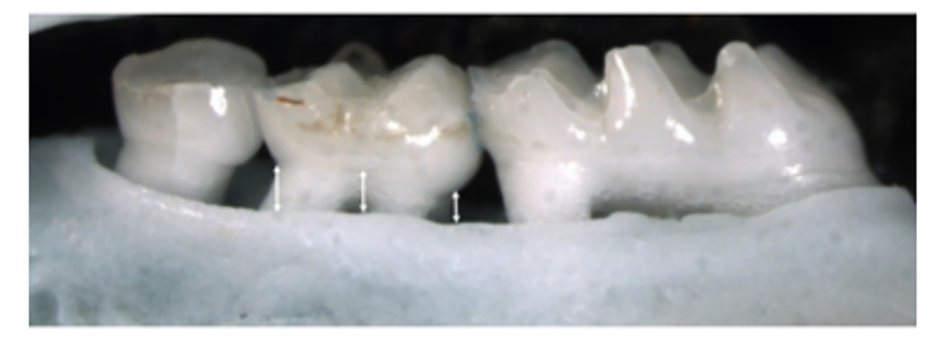
Fig 1. The distance between the CEA and the ABC as a measure of bone height. The distance between the cementoenamel junction and the most coronal part of the surrounding bone was measured at three sites of the middle molar tooth.

We manually dissected the maxilla of mice and, to remove the remaining tissue, a solution of 1% NaOH was added and boiled for 4 min at 100°C, after which the solution was disposed. Jaws were stained to highlight the cementum-enamel junction with a solution of 0.04% methylene blue for 1 min. Samples were dried at 65°C for 12h, before taking standardised photographs. As a measure of alveolar bone height, we measured the distance between the CEJ and ABC, where larger measures of distance correspond to a lower bone height and consequently poorer oral health. The distance between the CEJ and ABC was measured in millimetres at 3 positions of the buccal region of the second molar on both sides of the maxilla (Fig.1). All measurements were performed using ImageJ.