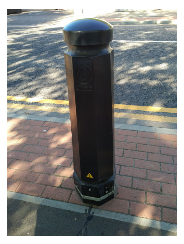
Figure 1. Sensor enabled pedestrian and cycle tracker.

As previously mentioned, there are significant challenges to considering the future implications of such novel systems and solutions that involve a wide range of stakeholders and contexts. We suggest that