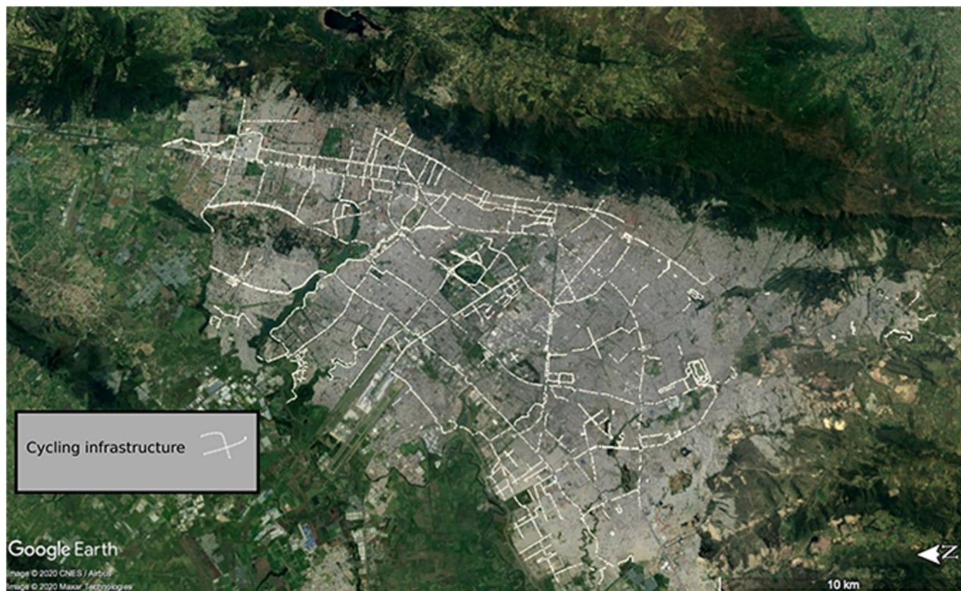
Fig. 1. Map of Bogotá's cycling infrastructure, made by the authors using Google Earth and based on shapefiles found at Bogotá's Council open data service: https://datosabiertos.bogota.gov.co/dataset/red-biciusuarios-bogota-d-c . (For interpretation of the references to colour in this figure legend, the reader is referred to the web version of this article.)

to pedestrians. Additionally, almost half of the infrastructure needs serious repairs. 5 It is not only cycle-exclusive infrastructure that has problems, however, as roads tend to be narrow and traffic-heavy and laws are not necessarily protective for cyclists. Furthermore, the number of cars has doubled in the last ten years and traffic jams and pollution have reached historic highs. 6 All of this is reflected in the worrying number of cycling traffic crashes that resulted in over 1200 cyclists' deaths and more than 20,000 injuries in the past two decades, figures that are especially concerning considering that underreporting is common. 7