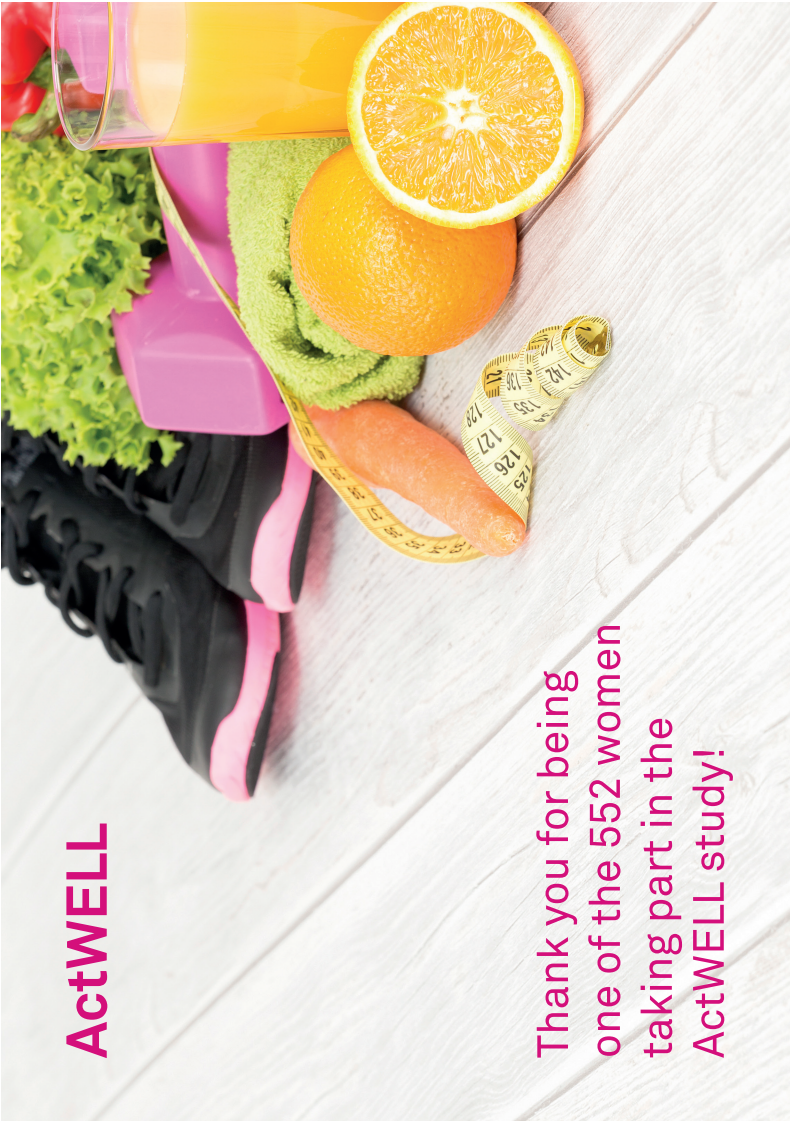
Figure 1. The ActWELL 12-month pre-notification card.