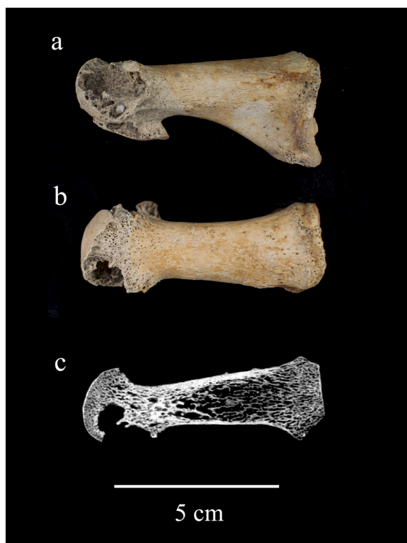
Fig. 2. Lytic lesions caused by gout in an adult male individual from the Augustinian friary (PSN 522). Photograph of the a) medial and b) superior aspect of the right first metatarsal with c) μCT scan section through the axial plane.

forthcoming a). The intense pain and physical impairment that can be caused by gout may have also been a contributing factor for why an individual would have been admitted to the Hospital.