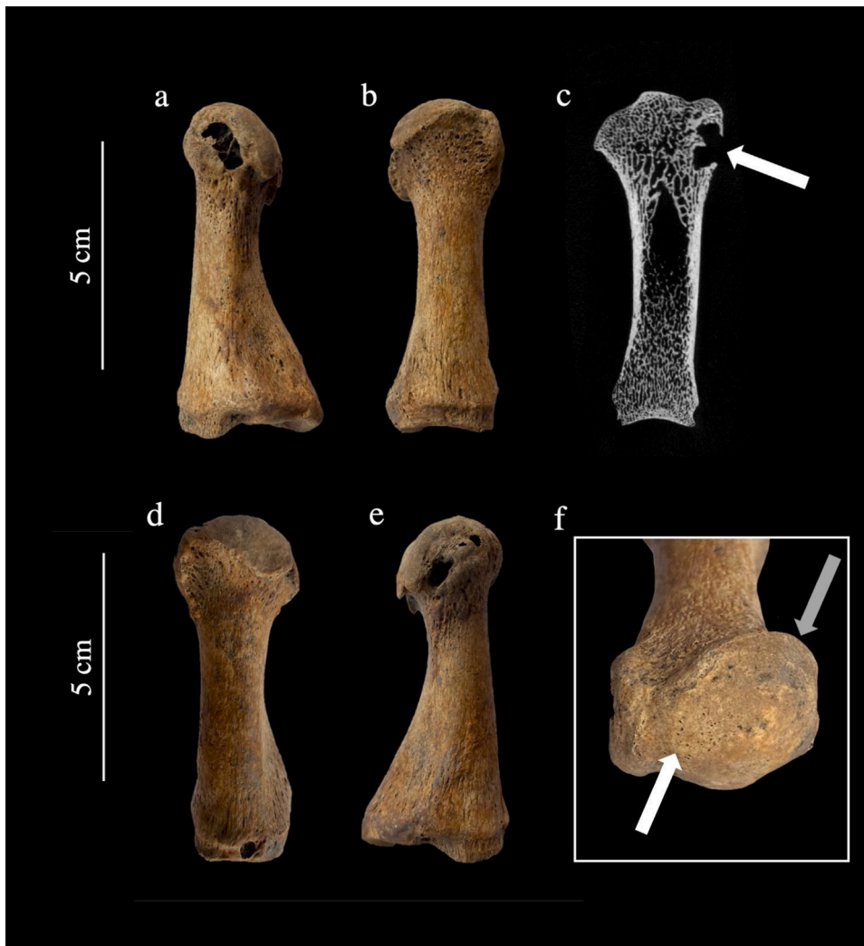
Fig. 4. Right and left first metatarsals from an individual with hallux valgus and gout from the Hospital of St John the Evangelist (PSN 42). Photographs show the a) medial aspect of the left first metatarsal with a lytic lesion with thin, overhanging margins associated with gout, b) dorsal view of left first metatarsal showing lateral deviation of the distal joint surface as well as flattening of the medial aspect of the head, and anterolateral extension of the joint surface consistent with hallux valgus, c) micro-CT scan of the left first metatarsal showing the thin, overhanging, sclerotic margins of the lytic lesion that are consistent with gout (indicated by white arrow), d) dorsal view of right first metatarsal with lateral deviation of the distal joint surface consistent with hallux valgus, e) medial view of right first metatarsal with lytic lesions, f) distal articular surface of the left first metatarsal showing a ridge on the joint surface consistent with hallux valgus (indicated by white arrow) and an anterolateral extension of the joint surface (indicated by gray arrow). Photographs taken by Jenna Dittmar, \mu CT scan by Bram Mulder.

period were also more likely to be able to consume a rich diet that includes purine-rich foods. Based on the burial location, the adult individual (sex unobservable) buried in the friary is likely of higher social status. Typically, burial in the friary was limited to those who had ties to the friary, or to those who gave generous donations to the friary in exchange for burial.