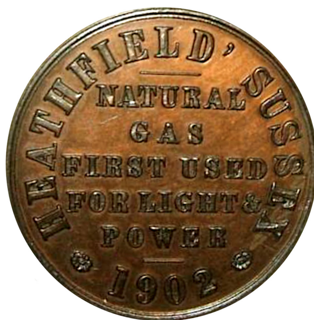
Fig. 3. Reverse side of medal which was struck to commemorate the coronation of King Edward VII in 1902 and was distributed to school children in Heathfield on Coronation Day. The striking of the medal was funded by Natural Gas Fields of England Ltd, a company that was wound up in 1905 amid suspicions of fraudulent activity (Sturt 1993). [From the collection of Graham Goffey.]

Despite being small in size, owing in part to wartime demand, some of the earliest East Midlands fields (Lees & Tait 1945) were developed via intensive drilling, for example Eakring-Dukeswood (197 wells) produced 6.5 MMbbl of oil (Storey & Nash 1993). Following a change in licensing