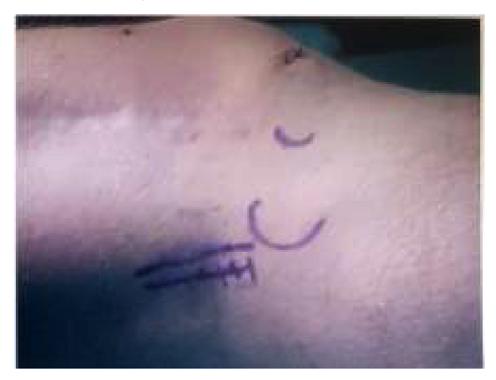
Image (4). Minimally invasive approach used directly over palpable fabella. Most posterior line utilised. Also marked are Gerdy's tubercle and the head of the fibula.