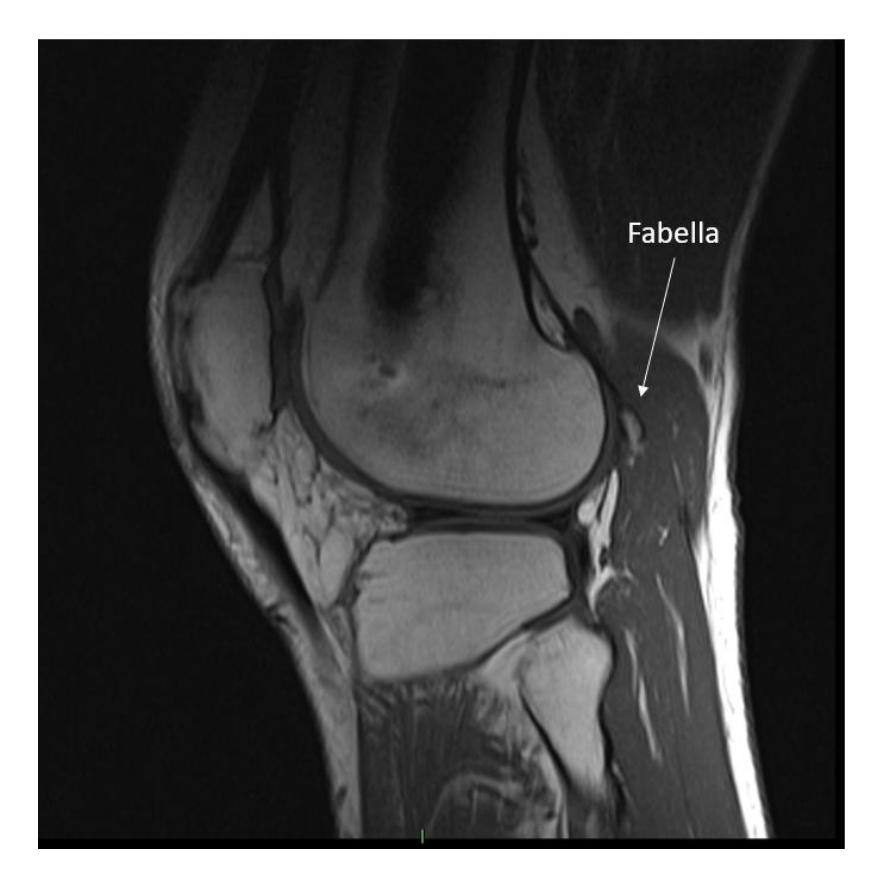
Image (1). MRI revealing fabella embedded within the lateral head of gastrocnemius.