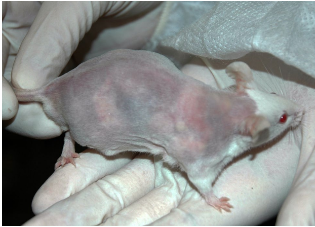
Fig. 1 Lactating MF1 mouse with dorsal fur shaved off to increase heat dissipation capacity

their capacity to dissipate body heat (Fig. 1). Shaving off dorsal fur increases the thermal conductance of lactating mice by 10–16% (Zhao and Cao 2009; Sadowska et al. 2019). In MF1 mice that were shaved before peak lactation,