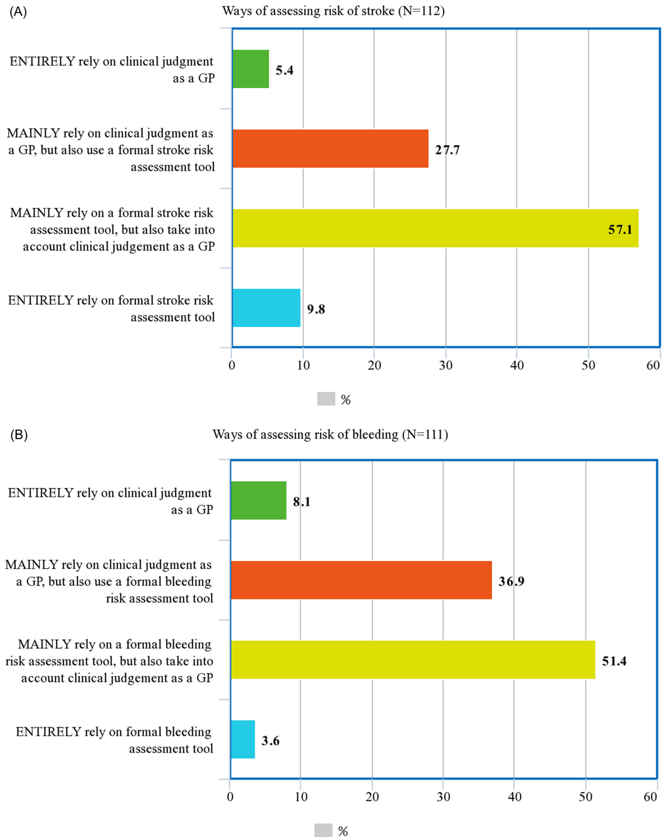
FIGURE 1 Ways of assessing stroke (A) and bleeding (B) risks. GP, general practitioner