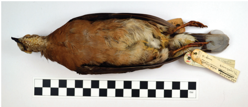
Figure 3. The second specimen identified as Haplopelia forbesi Salvadori, now at the Natural History Museum at Tring (NHMUK 1896.10.22.1)