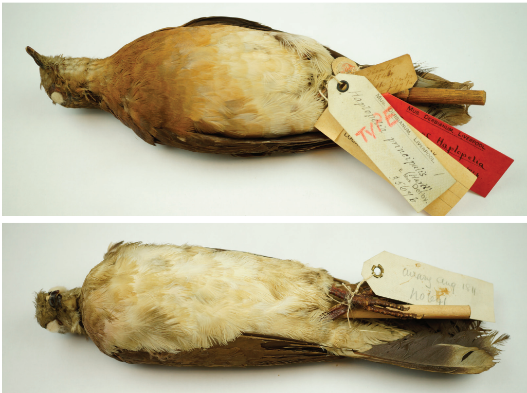
Figure 1. Forbes' Lemon Dove Haplopelia forbesi (NML-VZ D3567b) (top) and Caribbean Dove Leptotila jamaicensis (NML-VZ D3567a) (bottom) bequeathed by the 13th Earl of Derby to the people of Liverpool and now in the Vertebrate Zoology collection at World Museum, National Museums Liverpool