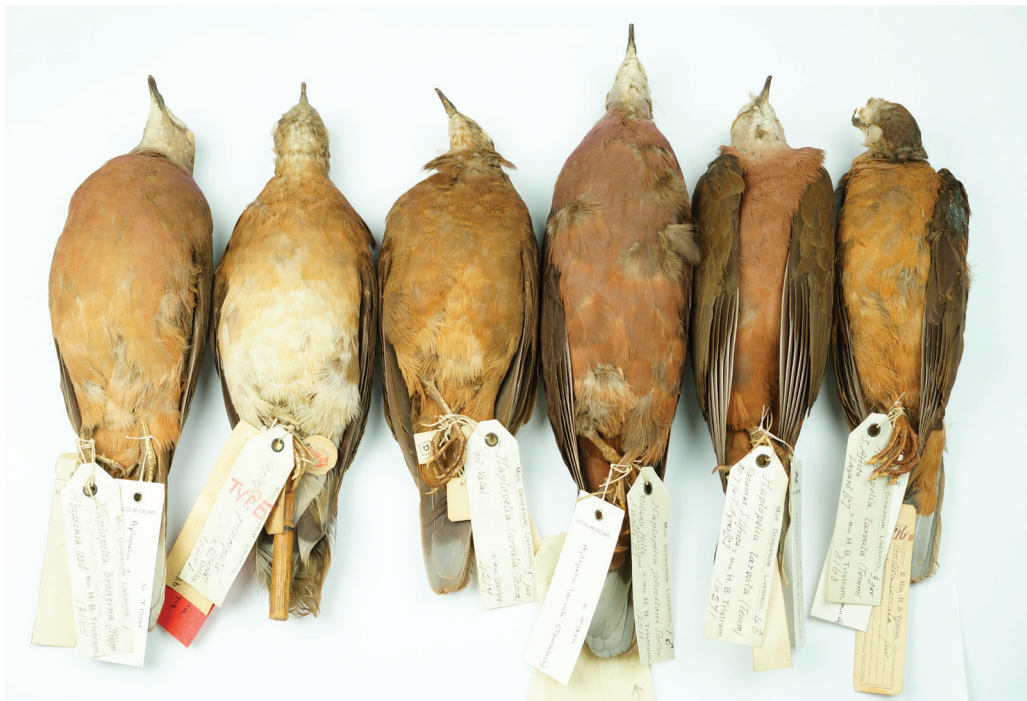
Figure 2. Specimens of Lemon Doves Columba (Aplopelia) larvata in the Vertebrate Zoology collection at World Museum, National Museums Liverpool. From left to right (subspecies according to labels): bronzina (NML-VZ T13165), forbesi (NML-VZ D3567b), larvata (NML-VZ D4217), johnstoni (NML-VZ T18511), larvata (NML-VZ T16271), larvata (NML-VZ T8168)

1851, along with most of his substantial natural history collection (World Museum 2021), founding what became the Derby Museum, Liverpool Museums (Morgan 1978) and now World Museum, National Museums Liverpool.