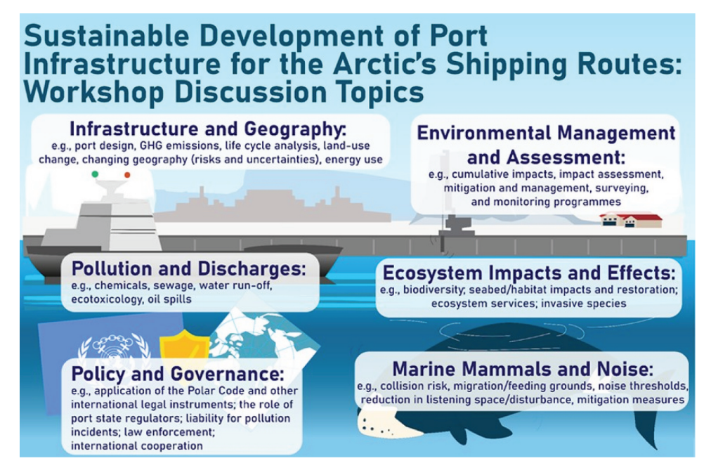
Figure 1. Predefined workshop discussion topics for a workshop focusing on the sustainable development of Arctic port infrastructure. Breadth of discussion included: planning and scoping, construction and development, operation, cumulative impacts, expansion and decommissioning and salvage.

Following input from the survey respondents, one of the predefined topics, 'Policy and Governance', was identified as a cross-cutting discussion topic, and is therefore discussed within all other workshop topic sessions, rather than as a stand-alone topic.