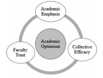
Figure 1. The Dimensions of Academic Optimism (Hoy et al., 2006)

is that these three dimensions are by no means disjunctive but in a reciprocal relationship.