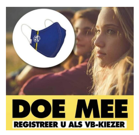
Figure 2. VB Facebook graphic advertising free face masks.

successful political movements elsewhere, where social media campaigning is paired with labour-intensive supporter mobilisation (Kefford, 2018, p. 659). Party elites referred to Donald Trump's campaign social media and rallies as an inspiration (Interviews 14, 30, 32).