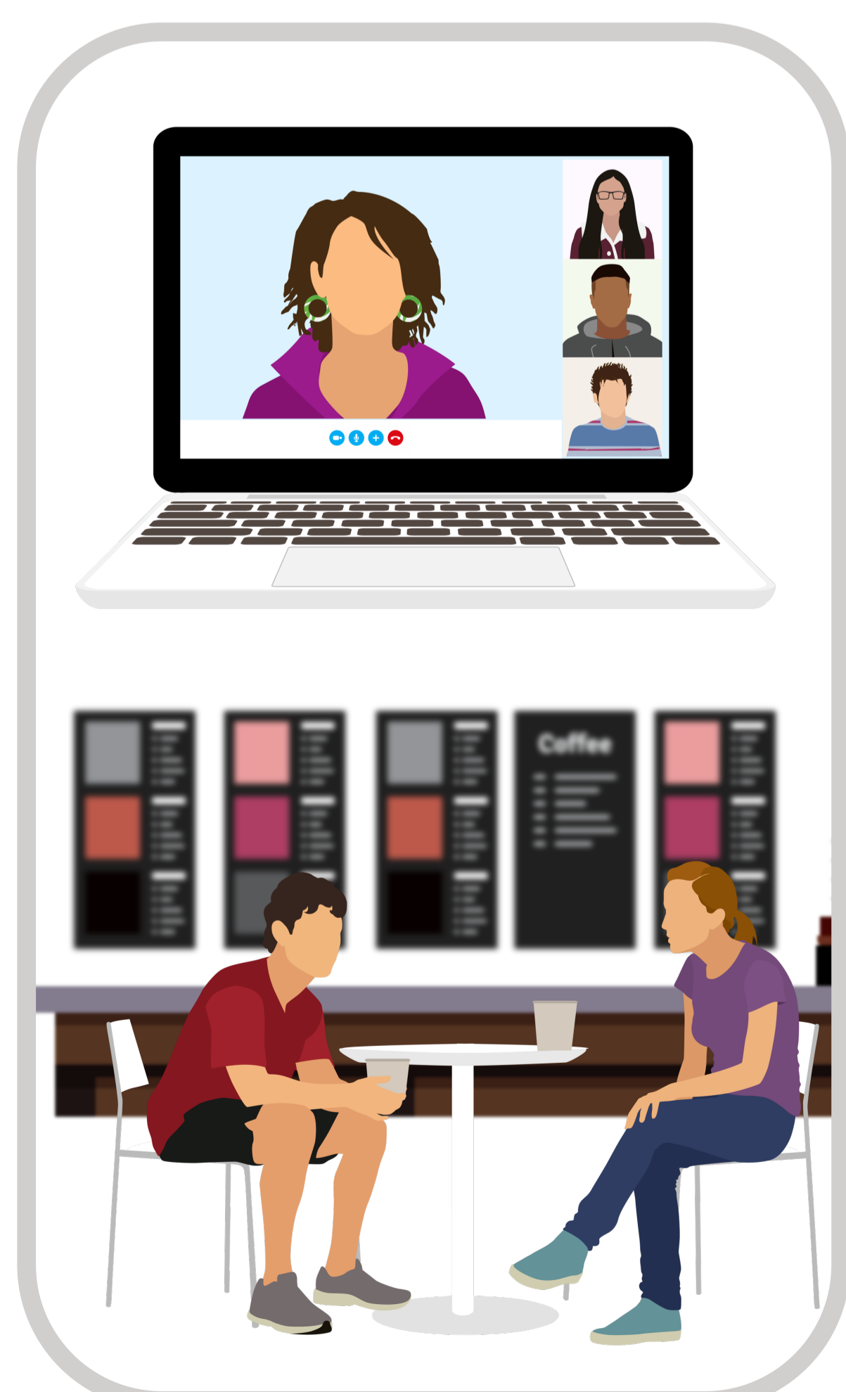
Individual support via a 'buddy scheme'