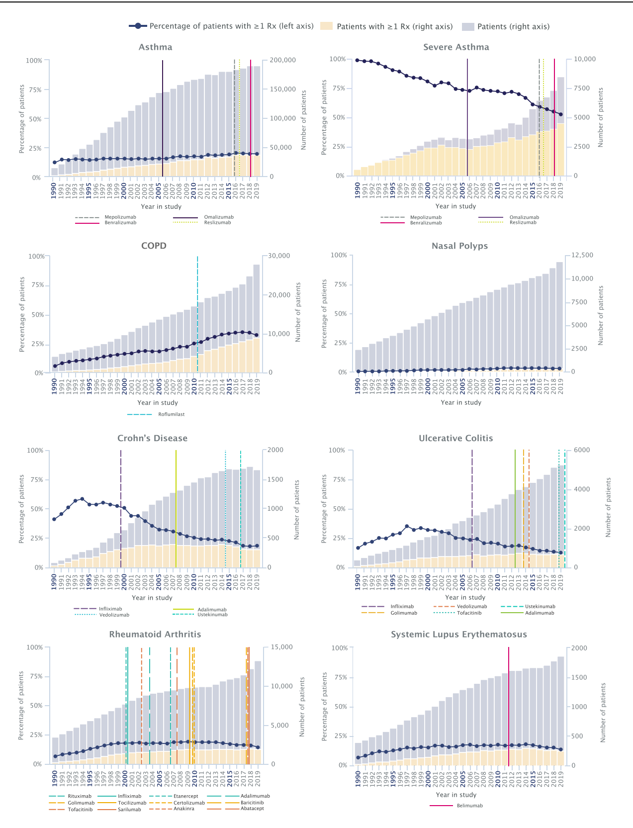
Figure 2 Patients with one or more prescriptions of SGCs. Number and percentage of SGC prescriptions per patient per analysis year for asthma, severe asthma, COPD, nasal polyps, Crohn's disease, ulcerative colitis, rheumatoid arthritis, and systemic lupus erythematosus. European Medicines Agency approval dates for biologic therapies are marked by vertical lines In order to minimize misattribution of an SGC indication, only one condition per patient per year for which an SGC could have been prescribed was used for these analyses.

Abbreviations: COPD, chronic obstructive pulmonary disease; SGC, systemic glucocorticoid.