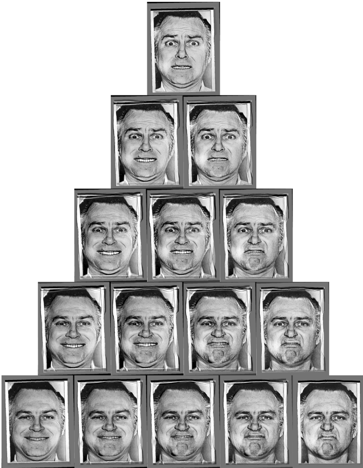
Figure 1. Array of emotional stimuli generated arranged in a triangle to show patterns of continuous variation. This image was created from photographs of 'JJ' [36], original image is ©Paul Ekman, reproduced with permission. doi:10.1371/journal.pone.0061941.g001

image for 10 seconds, after which a sound clip counted 3–2–1, and a photograph was taken; then the next image appeared. A webcam (Logitech HD C310) mounted on the top of the screen was used for photocapture. The run was then repeated. Participants were