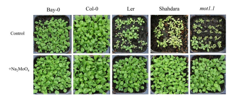
Figure 3. Chemical complementation links growth defect with Mo shortage. Accessions with potentially functional (Bay-0, Col-0) and defective MOT1 alleles (Ler, Shahdara, mot1.1) were grown on peatmoss substrate watered with nutrient solution containing either traces of Mo ('Control') as in Figure 1, or 1 mM Na<sub>2</sub>MoO<sub>4</sub> ('+Na<sub>2</sub>MoO<sub>4</sub>'). pH was checked to remain unchanged across treatments at \sim 5. doi:10.1371/journal.pgen.1002814.g003