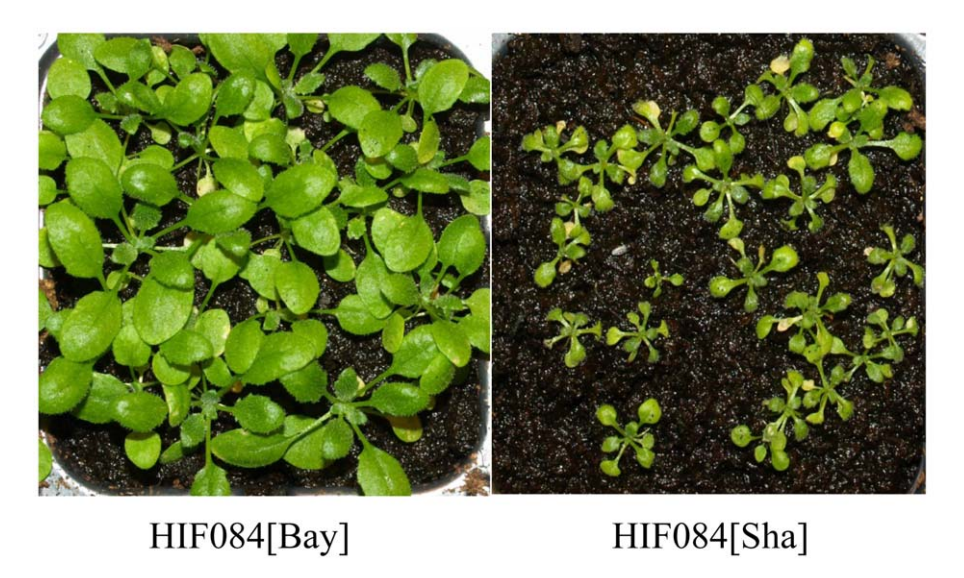
Figure 1. Acidic peatmoss substrate induces severe growth defect linked to the Shahdara allele. When grown on peatmoss at a pH close to 5, Shahdara is subject to severe growth and developmental arrest, necrosis and death, contrary to Bay-0 which develops normally. In the cross between these two strains, this phenotype is entirely controlled by a single locus (Figure S1), as confirmed by near-isogenic line 'HIF084' segregating solely for a region of chromosome 2. doi:10.1371/journal.pgen.1002814.g001

may be heterogeneously distributed and therefore require local description [5] and study of local adaptation [9,11], which is greatly facilitated by the identification of the causative locus.