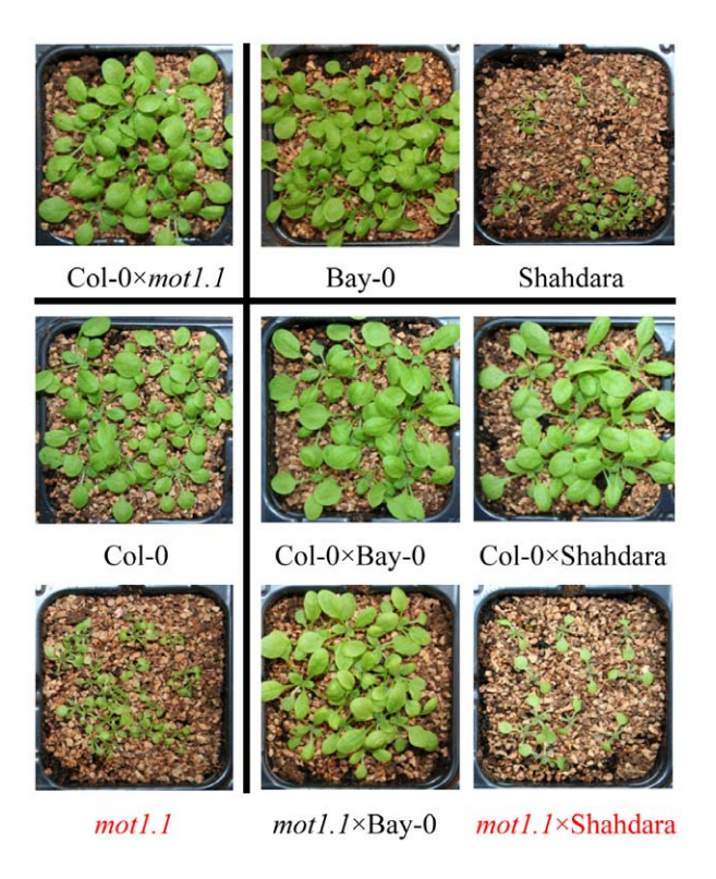
Figure 2. Mutant analysis and allelic complementation confirms MOT1 as the likely causative gene. Peatmoss phenotype of diverse genotypes is shown, including Bay-0 and Shahdara parental lines, mot1.1 mutant and its wild-type genetic background (Col-0), and F1 plants from complementation crosses between these genotypes. Unlike other alleles, the Shahdara allele at MOT1 is not able to rescue the mutant phenotype. doi:10.1371/journal.pgen.1002814.g002

from 'West-Asia') and 5 A. halleri accessions (I-14, I-16, F-1, PL-22 and TZC; obtained from H. Frérot at Univ. Lille [34]) were sequenced at MOT1 (including 1 kb upstream and 0.3 kb downstream for A. thaliana accessions) and at two reference loci, COII (At2g39940; 2,600 bp coding sequence) and PI (At5g20240; 2,150 bp coding sequence). Those genes were either used previously as reference or shown to have a neutral pattern of polymorphisms in A. thaliana [35,36]. Sequences were aligned using Codoncode Aligner v3.7.1. and subsequent alignments were improved visually.