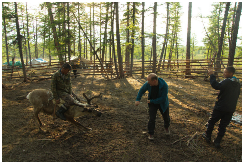
Fig. 4. Training a reindeer for saddle, Amudisy, Zabaikalskii Krai.