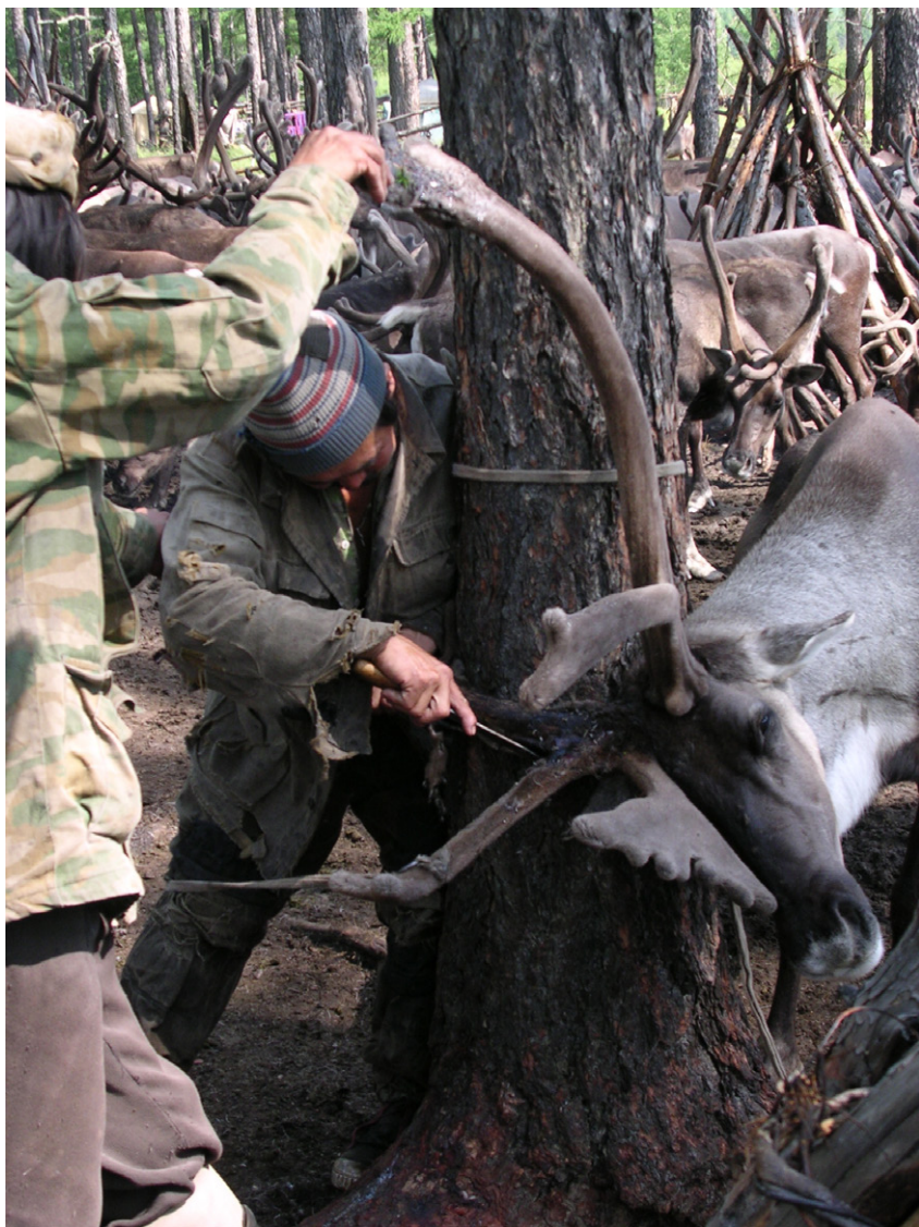
Fig. 1. Early summer antler trimming, Bazarnaia River, Zabaikalskii Krai.

as the first appearance of harnesses and hobbles. It also distracted attention from the more subtle ways that herd animals and people work together or show concern for each other.