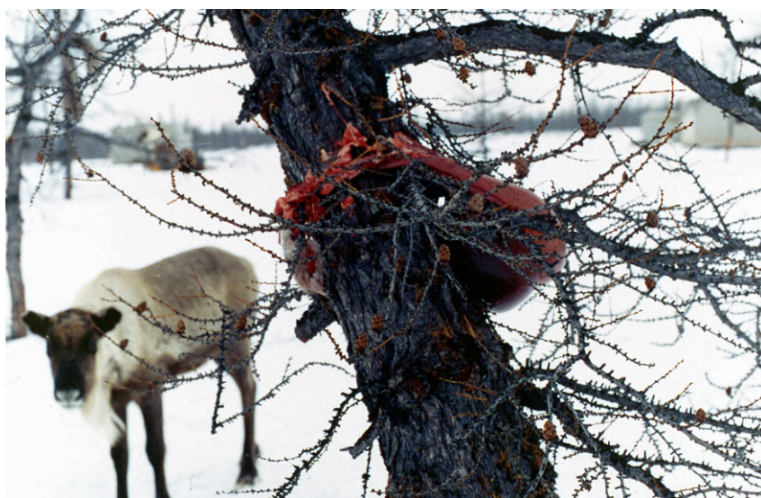
Fig. 2. The gift of a reindeer foetus to the tundra, Khantaiskoe Ozero, Taimyr.

clothing) to visible or non-visible entities on the land. Some of the traditional Siberian rituals are the most colourful where, for example, a foetus from a pregnant reindeer perhaps accidentally slaughtered will be hung in a tree as a “gift to the taiga” (Fig. 2). Similarly upon travelling into a new watershed a thread with coloured fabric will be hung on a tree as a token of respect to the spirit-masters which control relationships in the new region (Fig. 3). A common circumpolar ritual is the gifting of food or alcohol to the fire “feeding the fire.” These small acts of respect may seem far removed from sober collection of statistical data in the debate on climate change, but in their own highly personalized way they point to a culture of attention to the opportunities that the land has to offer. Common to many Northern