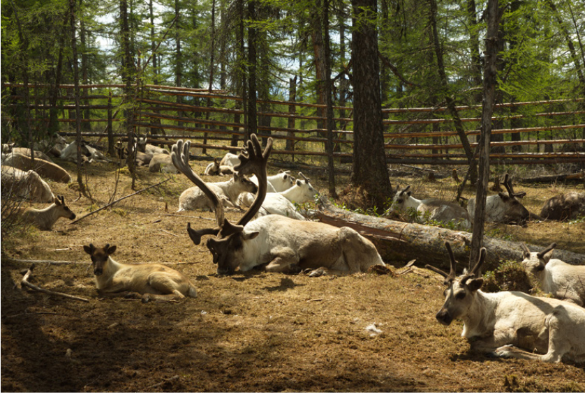
Fig. 6. Marshalling corral, Amudisy, Zabaikalskii Krai.