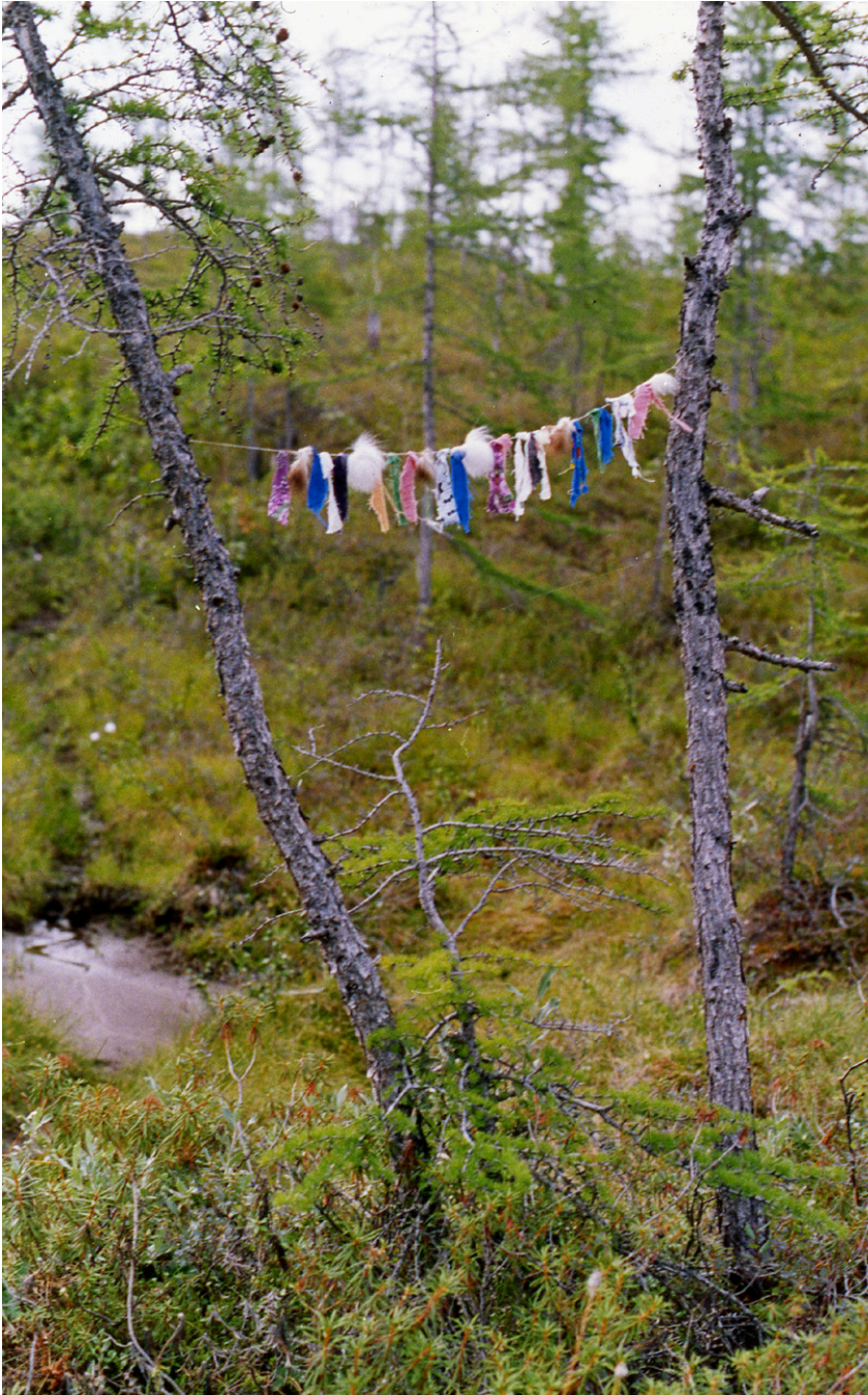
Fig. 3. A threaded set of fabrics gifted to the tundra, Khantaiskoe Ozero, Taimyr.