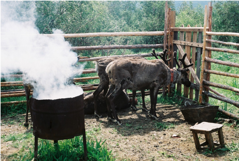
Fig. 5. Milking Corral, Nechera River, Irkutsk Oblast'.

Within archaeology, one of the classic structures is the milking corral—a