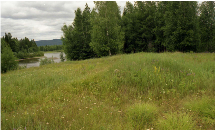
Fig. 7. A reindeer meadow at Lake Tolondo, Irkutsk Oblast'.

The example of architectures of domestication makes it easier to speak of relations between trust and domination, and indeed to leave behind these two stark opposites. Enclosures, or windblown ice-patches, both attract and confine, protect and release. They provide potentials or certain affordances which allow relationships to be built. They of course also have their own intrinsic qualities. Some places can be “good” (Johnson 2000) while others