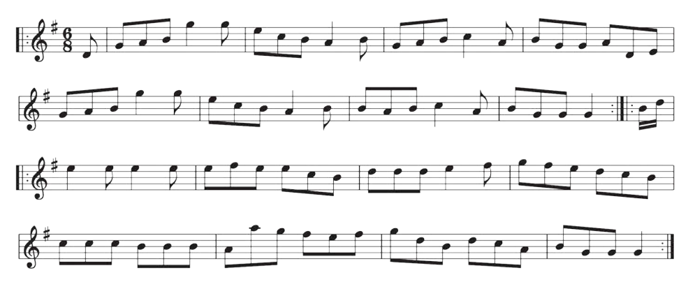
Figure 4 'Rakes of Dromina'