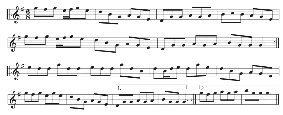
Figure 5 'The Fire on the Mountain'