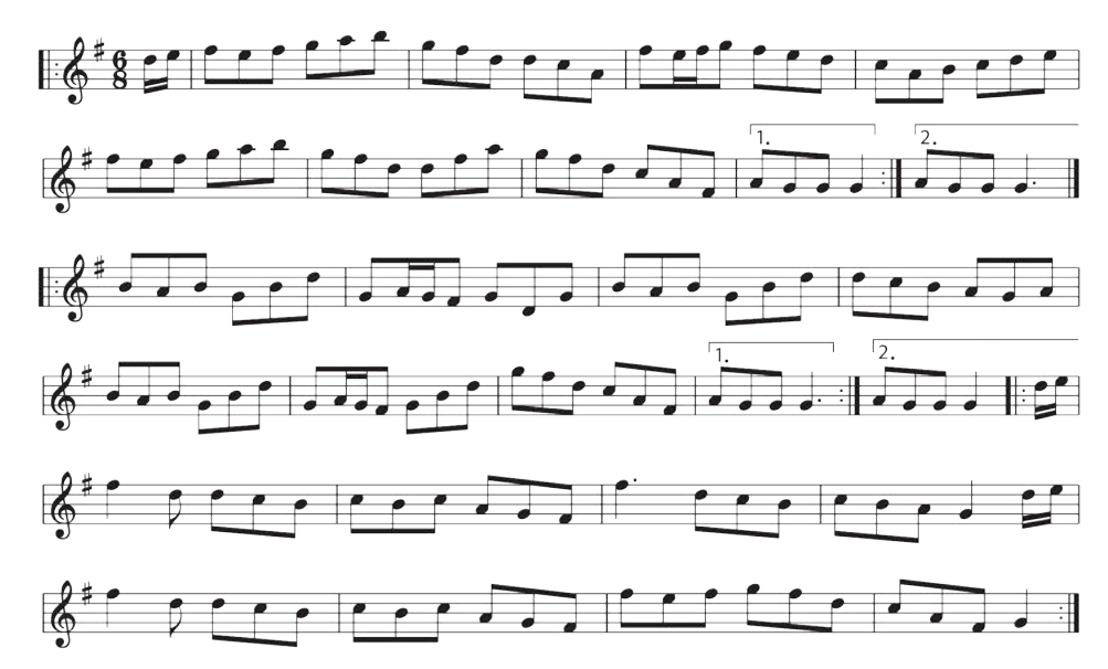
Figure 3 'Walls of Liscarroll'