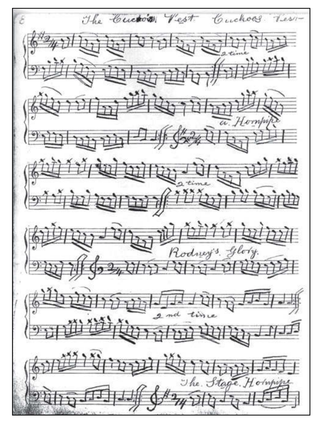
Figure 1 Page eight from the John Murphy Manuscript