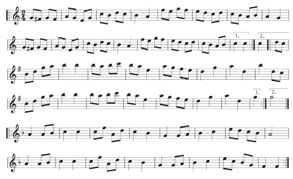
Figure 7 'The Prince Imperial Galop'