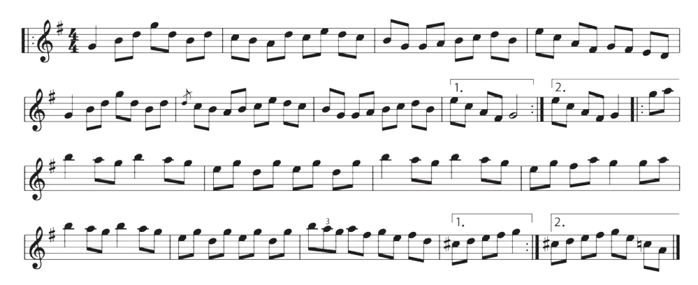
Figure 8 'Coming through the Field'

The manuscript contains a selection of tunes and settings which have now vanished from the popular repertory, both locally and nationally, and represents that of a traditional musician in the Churchtown area of North Cork during the late nineteenth and early twentieth centuries. The vast majority of the tunes, and indeed many of the tune-types, which the manuscript contains, are no longer found in the aural repertory of the area. The manuscript therefore provides a snapshot of the music of a small rural community at a particular point in time. The tunes and tune-types are similar to those used contemporaneously in other areas of the country, although it is likely that many of the settings were unique to the area. The mixture of Irish and non-Irish material is not unusual for the era; the influence of the travelling companies, and the military band in Buttevant, may also have been