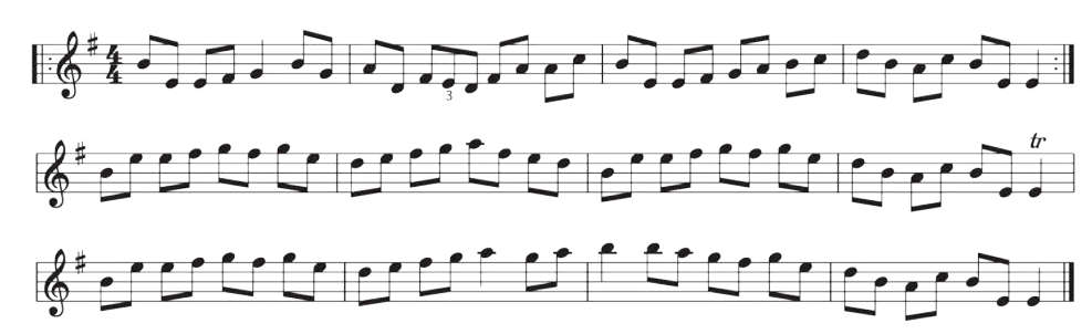
Figure 10 'The Kerry Star'