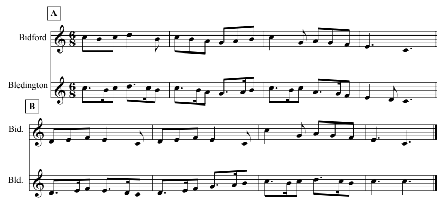
Figure 10 'Bidford Town Morris' / 'Hey Diddle Dis'

Judge wrote, 'In 1910 de Ferrars gave Sharp the tune for what he called "Bidford Town Morris", which may seem to indicate some kind of local connection for this dance.'<sup>35</sup> Judge surmises that because Ferris called this 'Bidford Town Morris' it may have been part of the original Bidford heritage. Despite its alleged local origins, it faded from the repertoire and was not collected by Carpenter, nor was it ever collected in Ilmington. Passing notes aside, the Bidford and Bledington renditions are nearly identical until the last three bars. In the penultimate bar there is again an example of the same melodic shape transposed down a fourth. As it is not a widespread melody, the close correspondence between the two variants may indicate that the music, at least, was heavily influenced by Bledington and adapted by Robbins (see Figure 10).