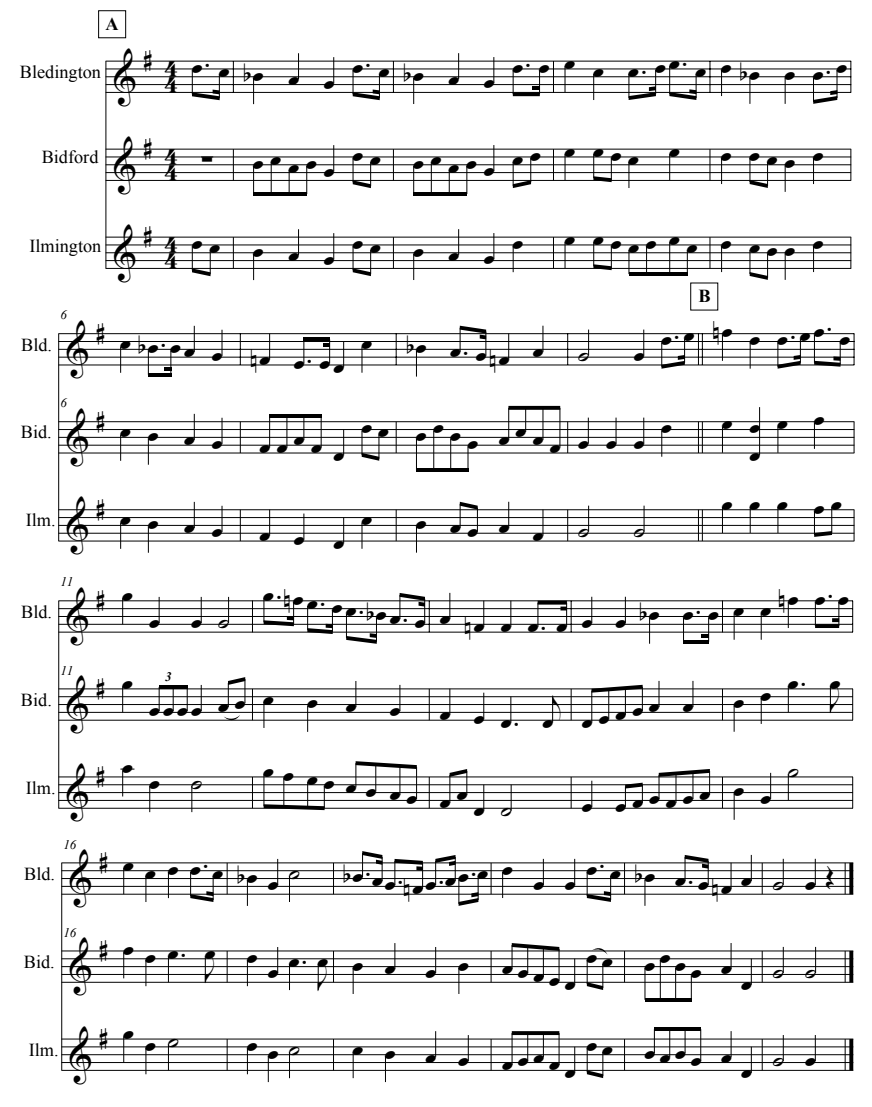
Figure 9 'Princess Royal' three distinctive versions