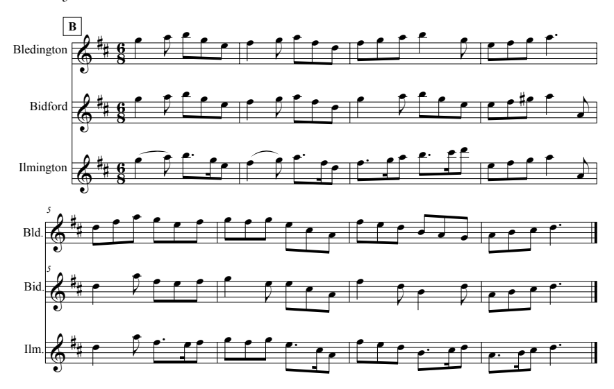
Figure 6 Extract from 'Constant Billy' showing raised note in Bidford rendition

'Constant Billy' is probably the most popular melody in the morris genre. There is a copy of it (but only the A section) in the Ferris MS (40), it was used in Ilmington and a version of it was known in Bledington as 'Billy Boy'. When all the renditions are lined up, there is very little difference between them, and what there is occurs on unstressed beats. Statistically speaking the Bledington tune differs from the Bidford tune in twice as many places than the Ilmington tune. The Bledington melody replaces the longer notes with passing tones and arpeggios. In five places Ilmington and Bledington use the same pitches, while Bidford uses a different one. Robbins raises the leading tone to the dominant in a certain stepwise run, where the