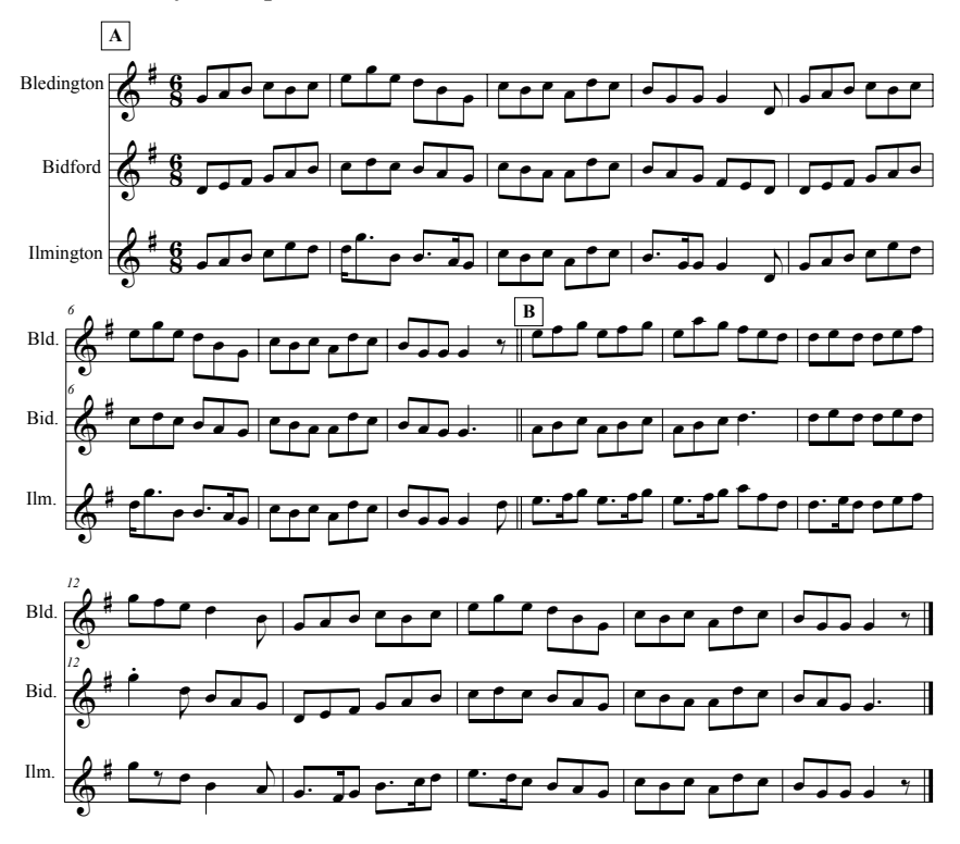
Figure 8 'Old Woman Tossed up in a Blanket'

version Robbins played. Whatever the source, Robbins appears to have made some adaptations, mainly transposition.