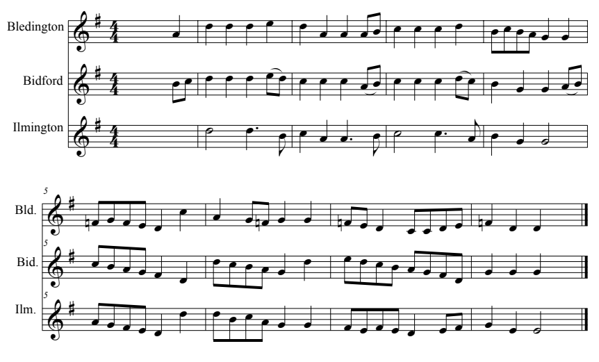
Figure 7 'Cuckoo's Nest'

This is another widespread melody, which can be very diverse in interpretation. Robbins' 'Cuckoo's Nest' only uses one strain of the tune, what is usually the B part in Britain. The A part is present in the Ferris MS, but the notation bears scant resemblance to what Robbins played. His tune is more closely related to the Ilmington version; yet again he avoids the minor mode. In bar 5, where the lines do not coincide, they follow the same contour, and Robbins continues this motif instead of following either of the other two lines very closely (see Figure 7). Judge suggested this tune came from Ilmington. If so, the tune diverged between Arthur's teaching and Robbins' and Bennett's performances.