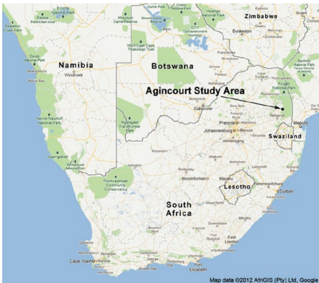
Figure 1. Agincourt Health and Socio-Demographic Surveillance Site (HDSS) in Bushbuckridge Municipality, Mpumalanga Province, South Africa.