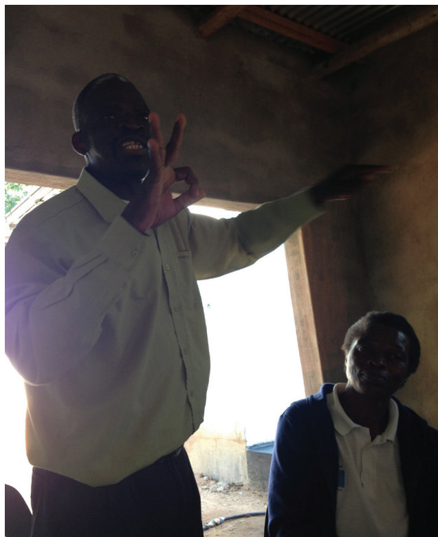
Figure 2. Focus group discussion (FGD) participant showing hand gestures used by medical staff to disclose HIV/AIDS status. Permissions were secured from participants for the reproduction of this image.

“...our people don't know about the channels to be used when they want to lay a complaint.” [Group A; Village Official]