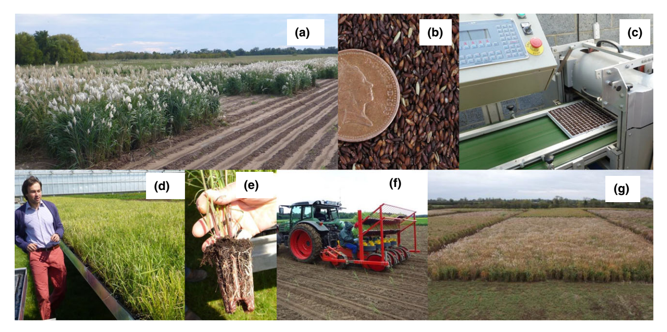
Fig. 1 Steps taken to develop seed-based Miscanthus hybrids: (a) Field seed production trials in CERES, USA. (b) Threshed Miscanthus sinensis seed with a British pound coin for scale. (c) High throughput plug sowing. (d) Dr. Michal Mos, checking plugs which are hardening for field planting in Lincoln. (e) A field-ready plug. (f) Mechanical planting of plugs with a Unitrium plug planter in Stuttgart, Germany. (g) Large-scale replicated 0.25 ha plot trials in Lincoln, UK.

The chances of seedling establishment in the temperate zones can be improved by covering the seed bed after sowing with photodegradable transparent polymer mulch films, as is used for maize (Keane et al. , 2003). These film coverings create conditions conducive to