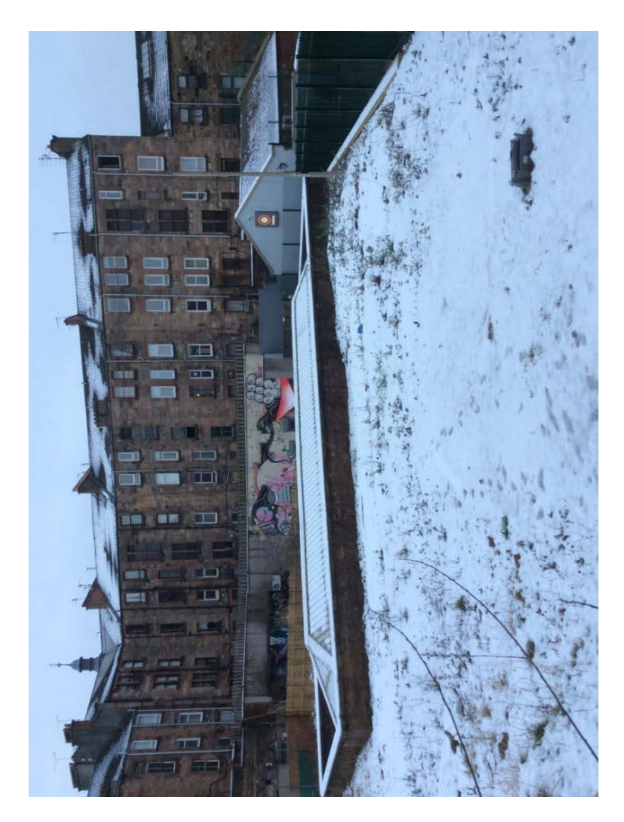
Figure 2 , shows the site of Kelvinhall station on the Glasgow Subway. It is in open cutting with a glass roof, with the surrounding Strathclyde Partnership for Transport (SPT) owned land undeveloped.