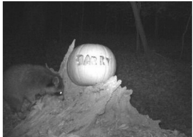
Fig. 3 Camera trap-picture of a raccoon taken by an Instant Wild camera in America.

Due to the reliability of both charismatic subjects and the visual technologies trained on these animals, there also